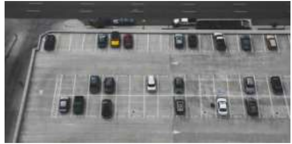
Fig 1: A Parking Lot

As the number of vehicles is increasing day by day, looking for vacant slots for those vehicles keeps getting more and more challenging. Drivers have to wait for a long time, in a queue in order to park their vehicles in parking lots, which again takes up a lot of time, fuel and effort. Mismanagement and lack of discipline while parking also adds up to the predicaments of parking. People tend to park their cars just anywhere on a road, thereby leading to huge traffic jams on the roads or may take up more space to park than their vehicle actually needs for parking, hence , they are not only taking up more space, but also denying space for another vehicle. The remaining part of the paper is structured as follows: the section 2 discusses about the various techniques used for Smart Parking Systems around the world. Section 3 summarizes aboutdifferent methodologies used. Section 4 briefs about method used in the proposed system and Section 5 concludes the paper.